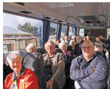
The Strathalbyn crew seemed to have had a good day!