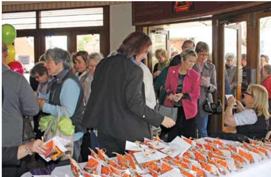
The crowds move in to collect their lollies and lucky envelopes from Central Office Staff.

We would also like to thank our wonderful volunteers for their dedication and service to Meals on Wheels over the past year, and for helping to make our 58th birthday a fantastic day.