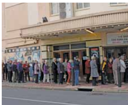
We have not seen queues before!